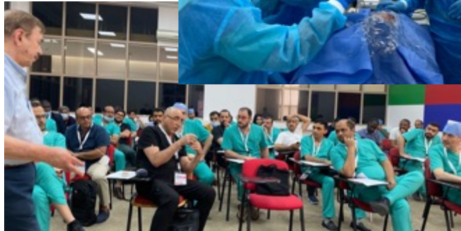
Meanwhile the Module 1 participants go through their practical session debrief.